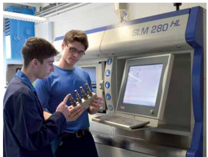
Fig. 1 SLM®280 at Oskar Frech

The conformal cooling of die-casting mold inserts creates new opportunities for the efficient tempering of cores, wipers and even anvils. Thus, thanks to the conformal cooling designed by Oskar Frech, significant improvements in the process, as well as the quality of the manufactured parts can be achieved.